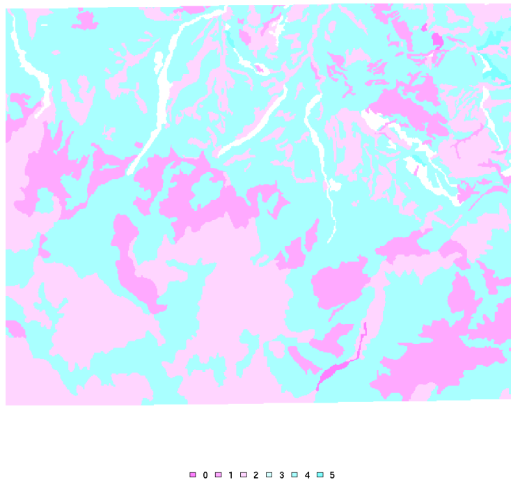
Figure 1: Soil pH values for Spearfish

Min. : 1.000 1st Qu.: 3.000 Median : 4.000 Mean : 3.380 3rd Qu.: 4.000 Max. : 5.000 NA's :17750.000