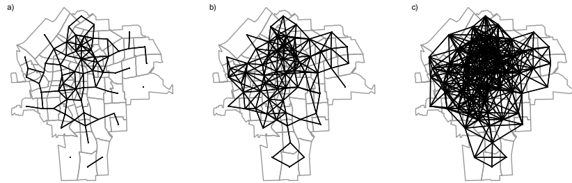
Figure 5: Distance-based neighbours: frequencies of numbers of neighbours by census tract

the numbers of links grow rapidly. This is a major problem when some of the first nearest neighbour distances in a study area are much larger than others, since to avoid no-neighbour areal entities, the distance criterion will need to be set such that many areas have many neighbours. Figure 5 shows the counts of sizes of sets of neighbours for the three different distance limits. In Syracuse, the census tracts are of similar areas, but were we to try to use the distance-based neighbour criterion on the eight-county study area, the smallest distance securing at least one neighbour for every areal entity is over 38 km.