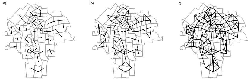
Figure 3: (a) k = 1 neighbours; (b) k = 2 neighbours; (c) k = 4 neighbours